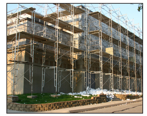
Bricks will soon be laid on The Family Life Center

of the windows in the office wing will be completed on Friday, Aug. 31 and Saturday, Sept. 1. The replacement of the clouded windows behind the stained glass is scheduled to start on Sept. 10.